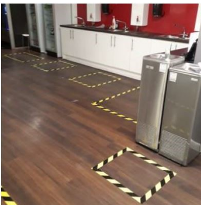
Revised staff kitchen layout