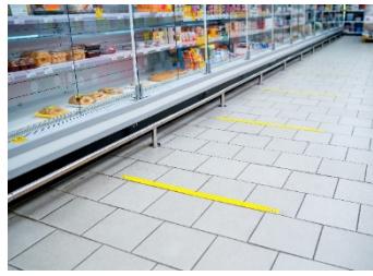
Social distancing markers in store