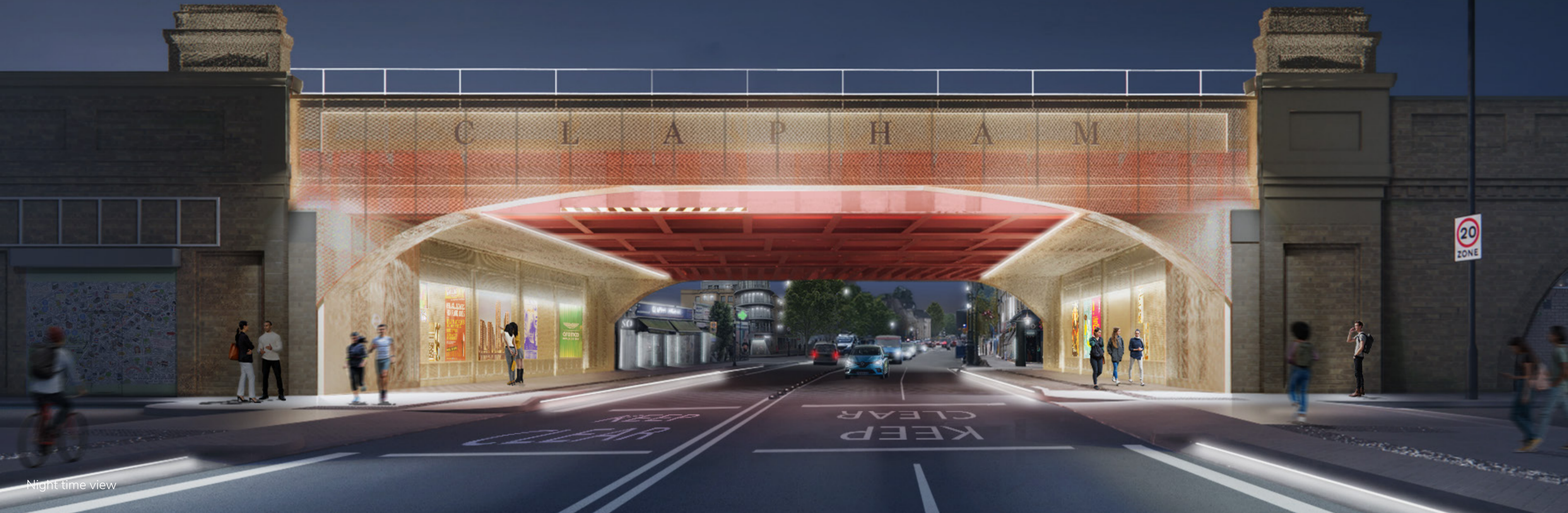
Night time view

The mesh design is carefully calibrated, with smaller perforations at lower levels to discourage misuse and prevent litter accumulation. Exposed fixings reference the original riveted bridge language while simplifying inspection and maintenance. The porous façade maintains natural light and ventilation, preserving openness and permeability.