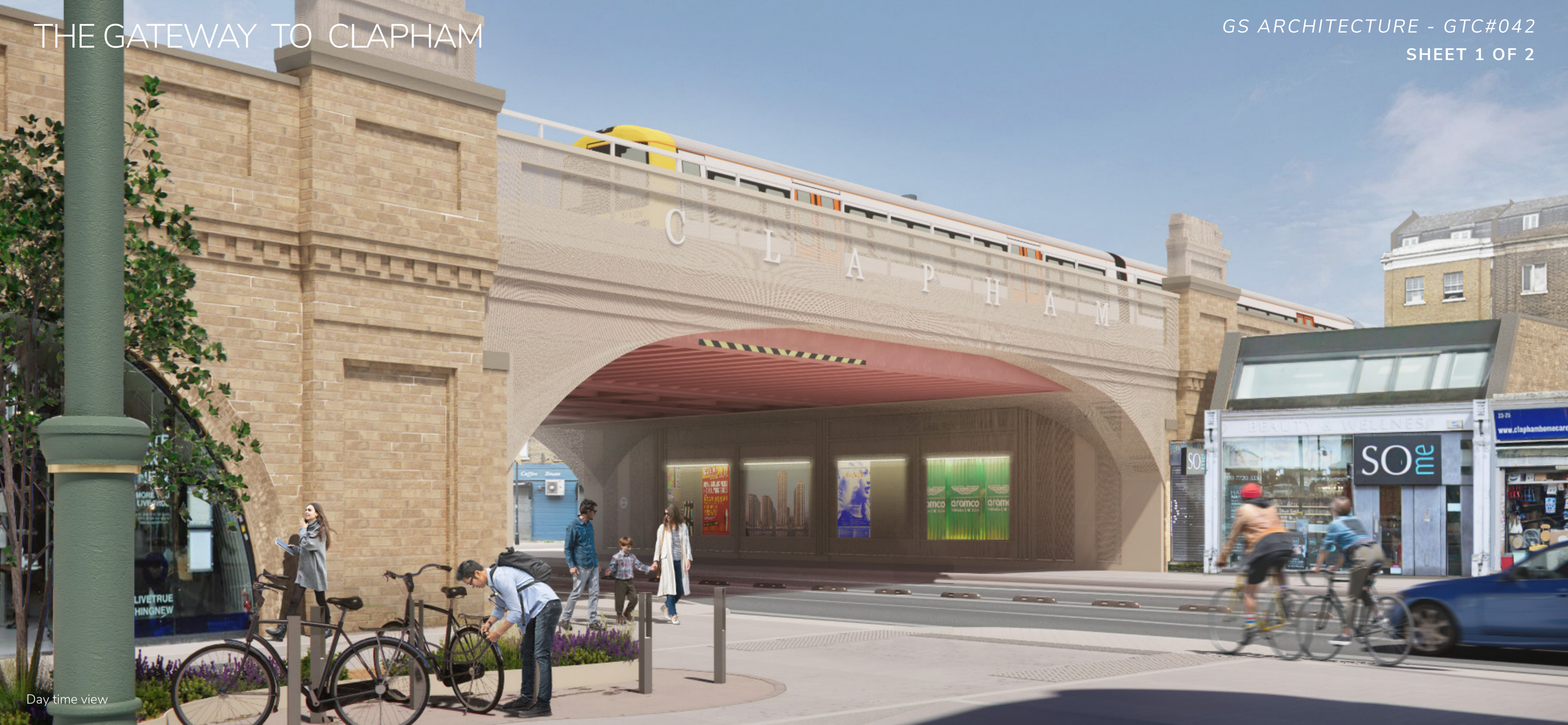
Day time view