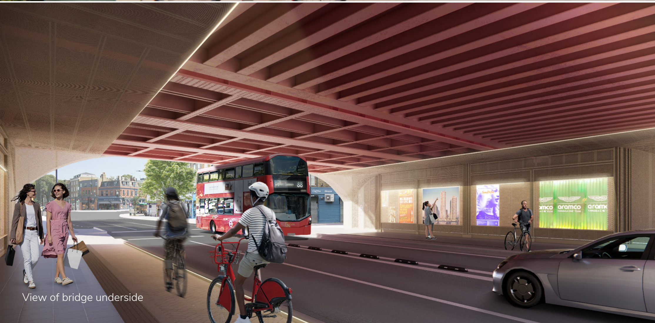
View of bridge underside

The existing double bridge is reimagined through the introduction of a perforated metal façade, creating the illusion of a much grander edifice. This contemporary intervention acts as an architectural homage to the historic character of Clapham and its surrounding conservation area, transforming the bridge from purely functional infrastructure into a recognisable landmark and connective threshold along the High Street.